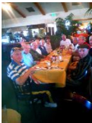
Cosmo Tennis players (+Jen) still friends after intense morning competition at Tennis