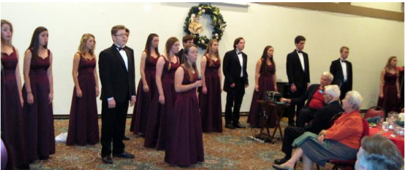
San Marcos Madrigal Singers