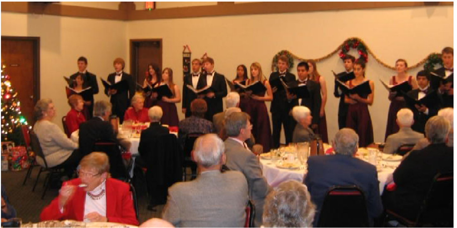
The San Marcos High School Madrigal singers